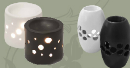
Starry Sky White / Black